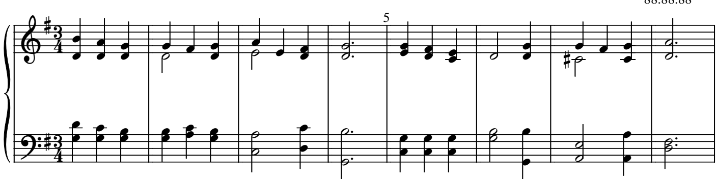
St. Catherine 88.88.88